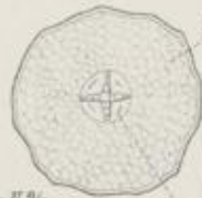
Fig. III. 20 \times .