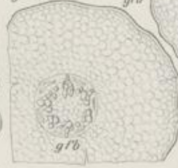
Fig. II. 20 \times .