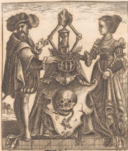
MORTALIVM NOBILITAS MEMORARE HUIUSMODI & IN AETERNUM NON