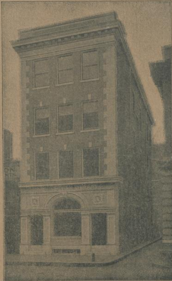
THE LLOYD LIBRARY.

DEVOTED EXCLUSIVELY TO A LIBRARY OF BOTANY AND PHARMACY.