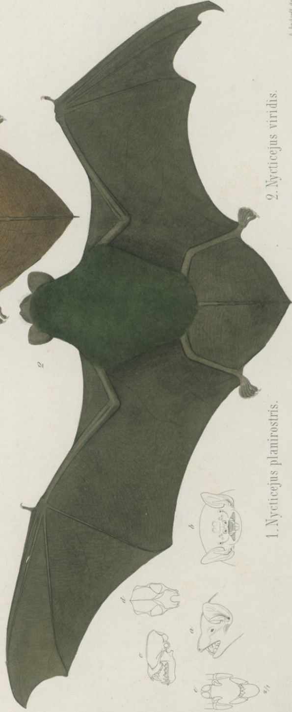
2. Nycticejus viridis .