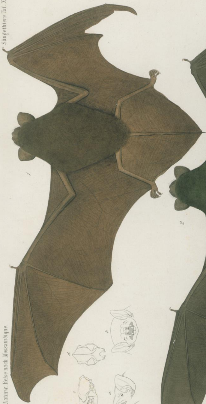
1. Nycticejus planirostris .