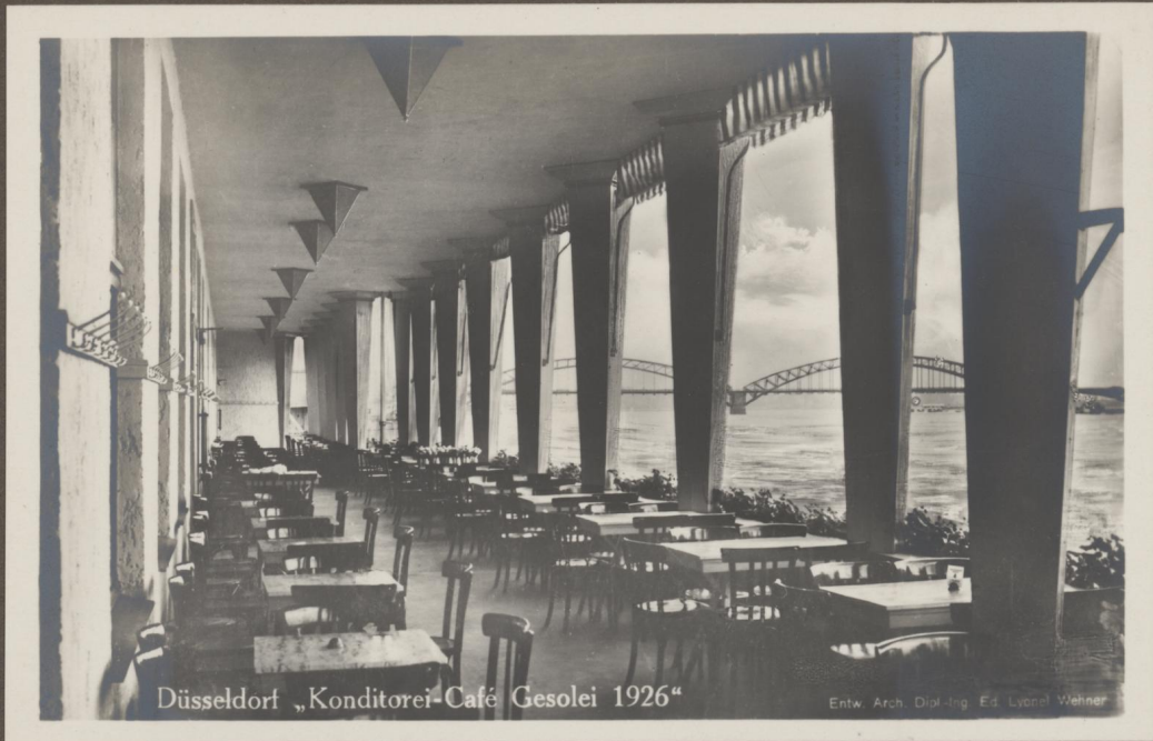
Düsseldorf „Konditorei-Café Gesolei 1926“